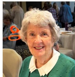
Annual head gear 😊