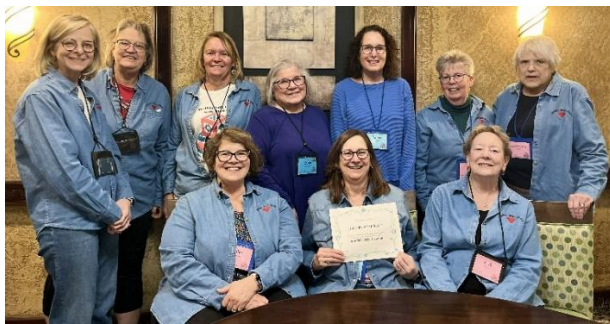
Quilters with Heart – 26% of their membership attended. Four additional guilds were recognized for attendance but we don't have photos. Sorry!