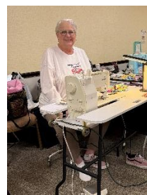
Portable sewing machine table