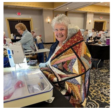
We recognize the smile!