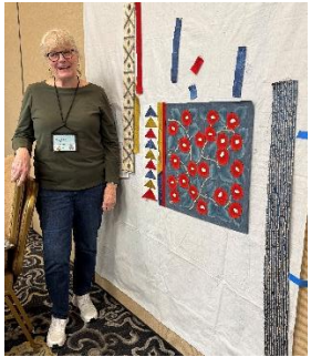
Special fabric from Japan deserves its own design.