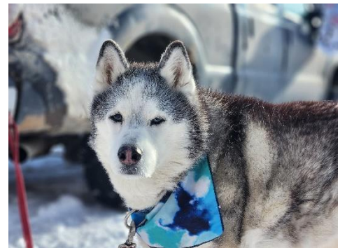
Sky at the Iditarod Official Start