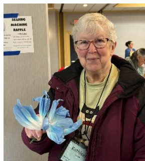
Open Sew friends pranking each other annually