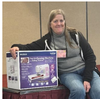
Raffle prize donated by Pins & Needles