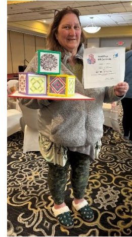
Grand prize – 2027 Getaway Registration