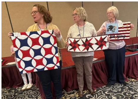
Pillow cover winners