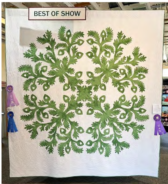
Best of Show & Best Hand Quilting

165, Hawaiian Sweetheart Judged in Applique Techniques