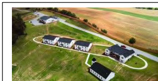
Safe Harbor Ohio

Ohio has some of the highest rates of sex trafficking due to its intersections of major interstate highways!!! The Safe Harbor organization provides a safe place for rescued (previously) trafficked women of many ages . Country Piecemakers Guild supports the work of Safe Harbor through donations of member-made quilts.