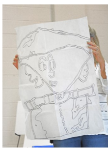
Outline of George to be used as the pattern.