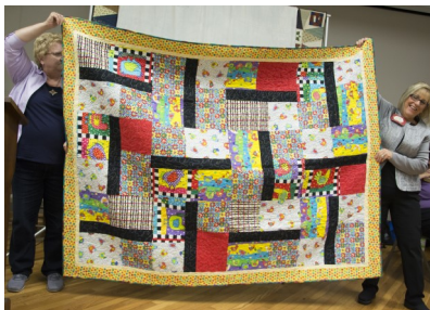
Guild Raffle Quilts 2019 Displayed

40 quilts donated to Women's Safe, Quilts of Compassion and Providence House