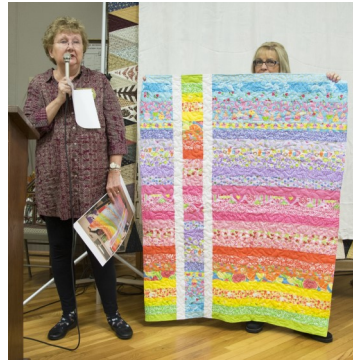
Calico Hearts Guild: 60 quilts and 123 pillow-cases for abused children taken from their homes