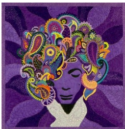
Prince Cherrywood Challenge 2018 Tribute Tour

NOTE: Click through all the tabs on the website. There's quite a bit going on, including a fabric, yarn, hand made Swap on Sunday.