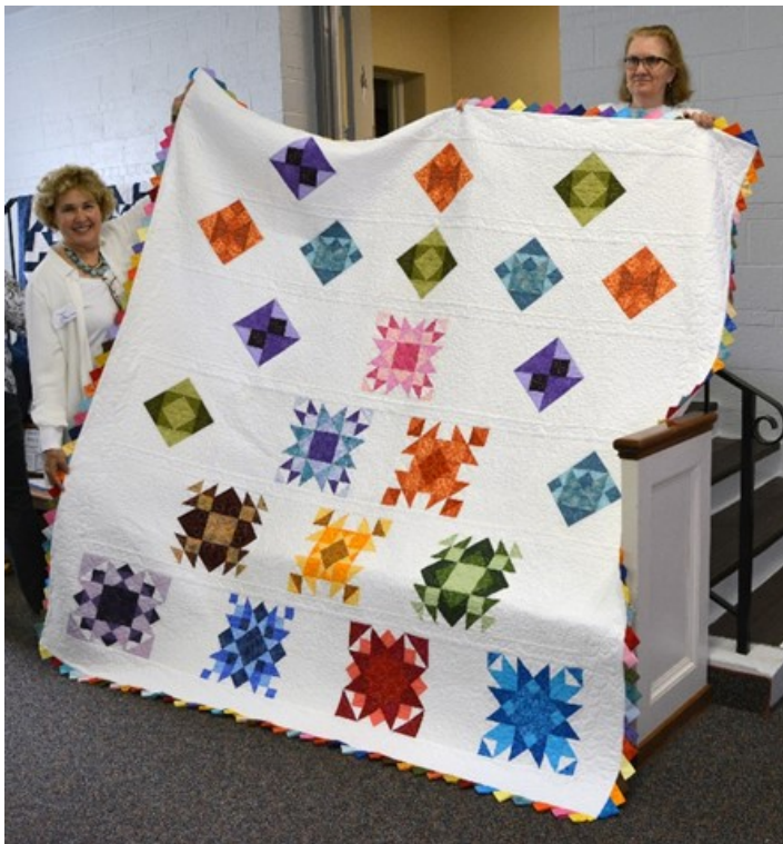
Quilting Stars of Ohio, Canton