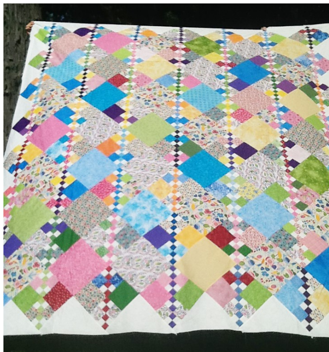
Wildwood Quilt Guild, Mentor