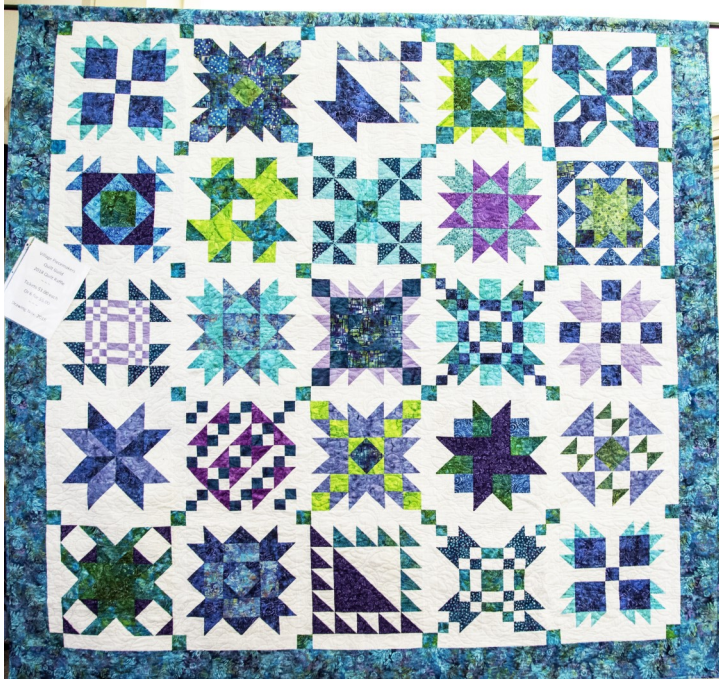
Village Piecemakers, Garrettsville