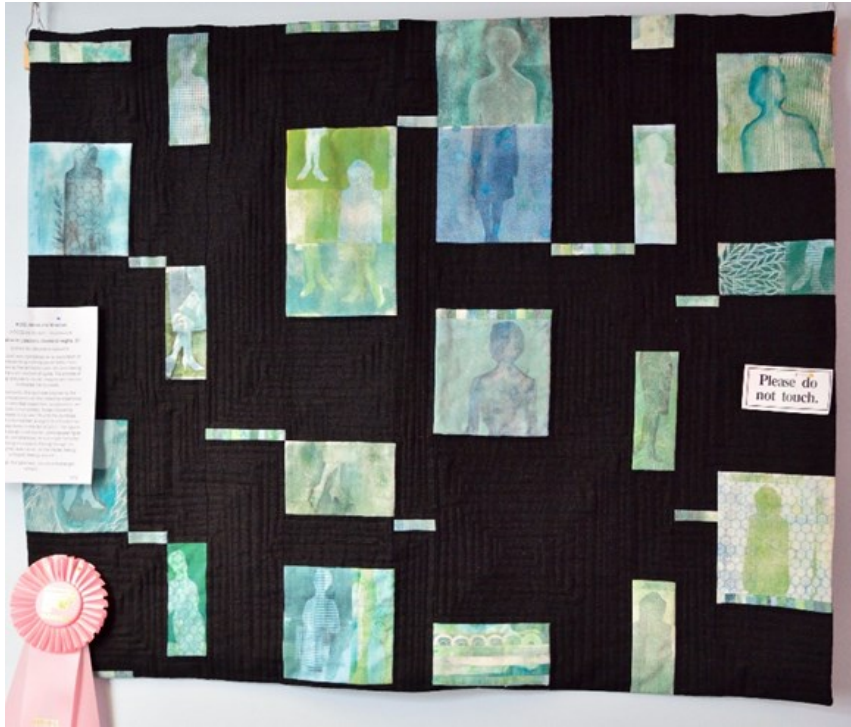
People's Choice — Animal Adventures by Jeri Fickes, Wooster, Tree City Quilters Guild Applique Technique - Small